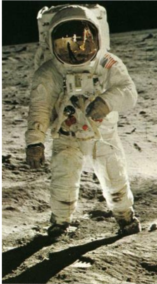
11 ASTRONAUT EDWIN E. ALDRIN JR. WALKS ON MO

Forty years after the moonwalk, a reflection on a childhood obsession for fame, a friendship and one more autograph.